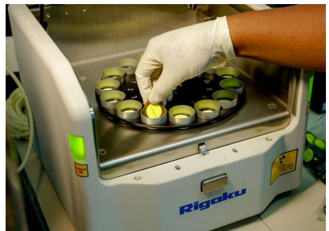
Product testing – Fortress Minerals’ high-grade iron ore