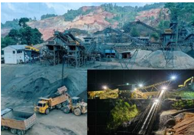
Mining site overview at the Bukit Besi Mine